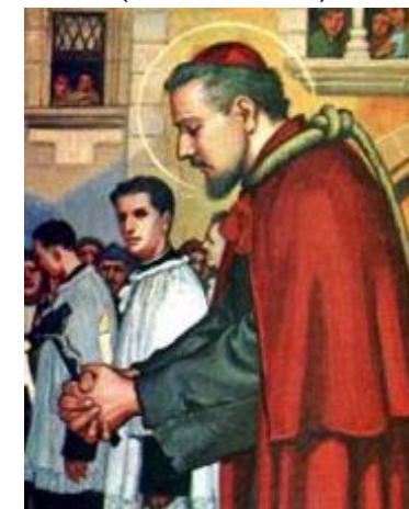
November 4 Patron of Seminarians and Catechists

Oh God, Maintain in your people that spirit with which you inspired your Bishop St. Charles, so that your church may be constantly renewed, conforming itself to Christ and manifesting Christ to the world.